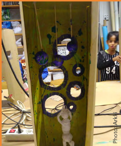
At Arkki pupils learn innovation skills and STEAM through architecture and design as real-world phenomena.

ARKKI: School of Creative Education for children and youth where pupils learn innovation skills and STEAM through architecture and design as real-world phenomena. Arkki's education programme has been certified by the Finnish Ministry of Education and Culture as a national extracurricular creative education programme. Arkki Finland school is in Helsinki.