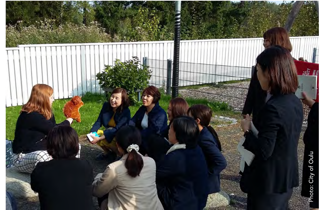
Japanese group visiting Sampola in Oulu.

"After the pandemic, Finland should have an advantage due to its fundamental strength of being a top-of-mind safe and clean destination among Japanese teachers and parents," estimates Numata: "2019 celebrated the 100th anniversary of diplomatic relations between the two countries. There has been a growing interest among Japanese consumers in