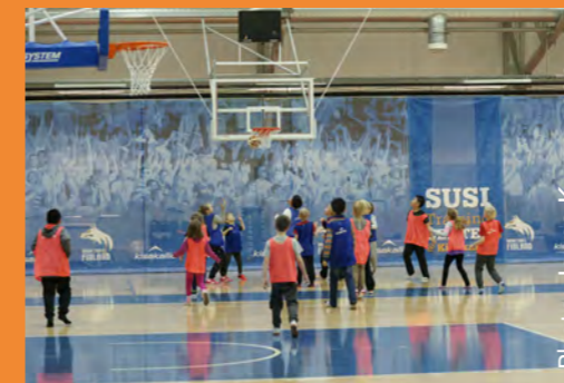
The pupils of Karjalohja school joined their Chinese visitors for a day of sports at Kisakallio sports institute.

SPORTS INSTITUTES: Finland has 11 sports institutes that are each a combination of an educational organisation, a training centre for elite athletes, and a leisure centre for the public, also offering school camp programmes including accommodation. For Olympic training, each institute specialises in specific sports, for example skiing ( Vuokatti and Rovaniemi ) or ice hockey ( Kuortane and Vierumäki .)