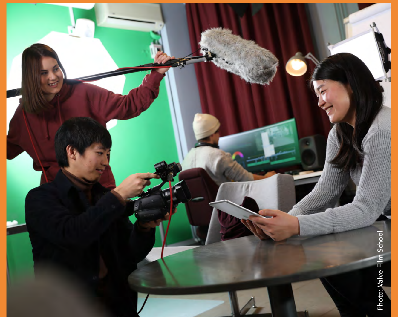
The Valve Film School in Oulu offers educational programmes for both pupils and teachers.