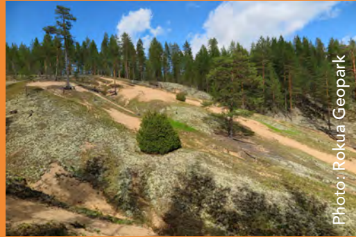
Geological and biological diversity at Rokua Geopark.