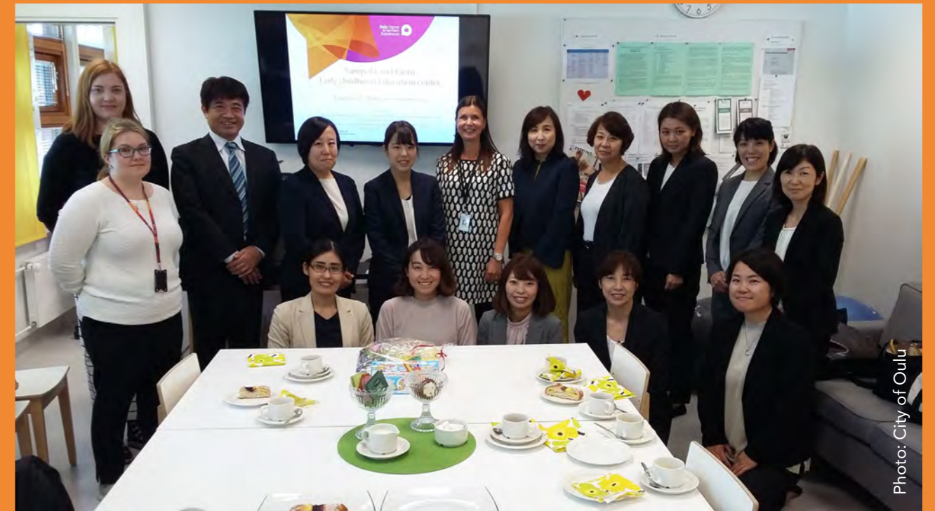
Japanese education professionals visiting Sampola in Oulu.